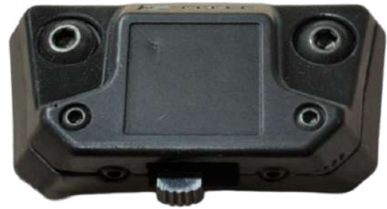
IMPEDANCE EXCHANGE SELECTOR ON BOARD THE SHELL