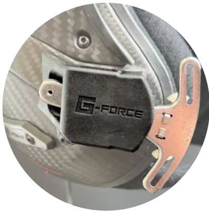
MAXILLO FACIAL ATTACHMENT