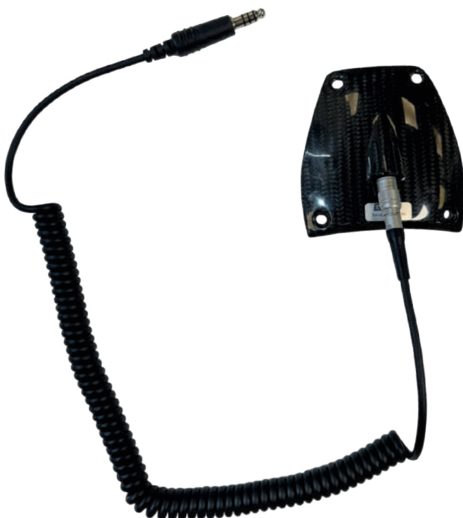
DETACHABLE CABLE KIT

Thanks to the installation of this kit it is possible to have a detachable and replaceable communication cable.